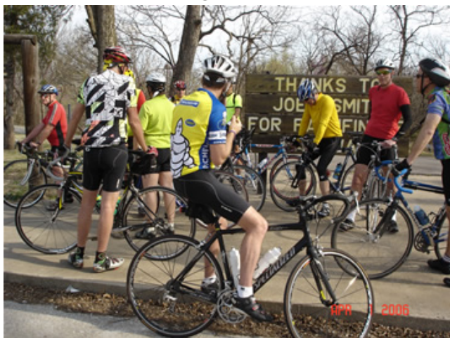
Pedalers gathering at Johnstone Park for a spring Saturday morning ride

BARTLESVILLE PEDALERS BICYCLE CLUB P.O. Box 793, Bartlesville, Oklahoma 74005