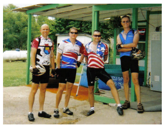
July 4th Century Crew

BARTLESVILLE PEDALERS BICYCLE CLUB P.O. Box 793, Bartlesville, Oklahoma 74005