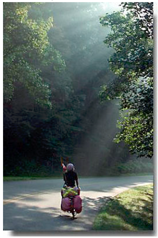
As we ride into the sunset of another bicycling year, the Pedalers wish you Happy Holidays and a Joyous New Year!

Renew your family membership for 2004 and get your name in the drawing for the FREE membership!