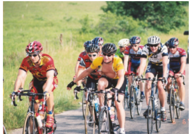
As we reflect on last years activities, such as the Woolaroc Road Race, the Pedalers wish you Happy Holidays and a Joyous New Year!

Renew your family membership for 2004 and get your name in the drawing for the FREE membership!