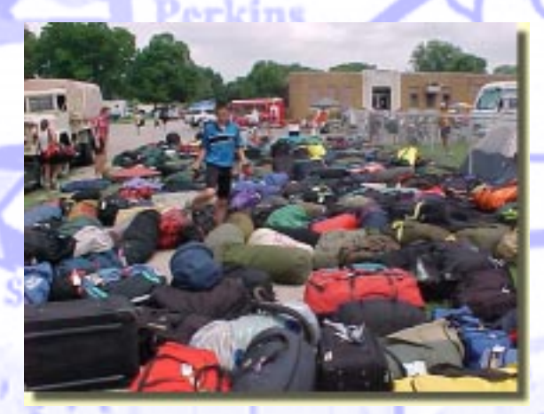
Moving and coordinating the gear for hundreds of people creates another "adventure" at FreeWheel.