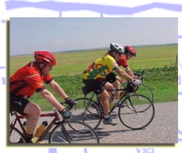
Head 'em up, ride 'em out, soon it will be raw bides! It's Day 1 and the official starting day.