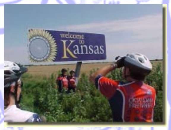
A site for sore eyes and a sign of the end of the ride on Day 7 - the final stop of South Haven was not far away.