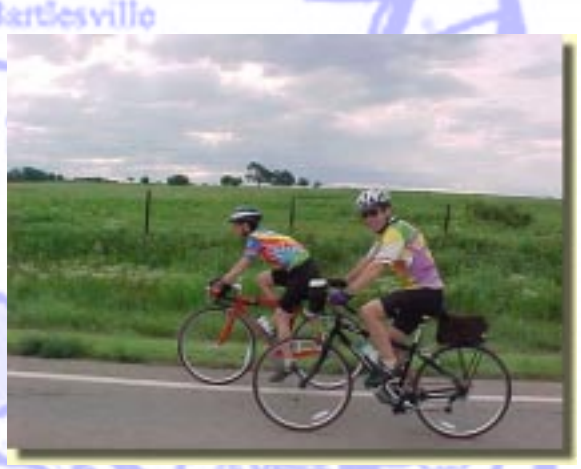
Riders enjoy a partly cloudy Day 5.