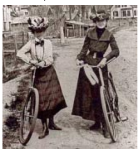
Riding's a lot more fun with friends!