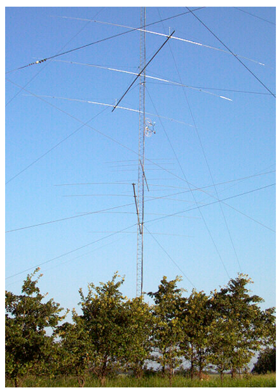
Well, what can you say? You don't see something like this everyday...

Little did I imagine my little prank would make the WWW - at the hands of someone else. I was